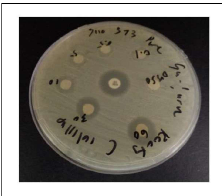
Figure 2 Moderate antibacterial activity of D. schinzii root extract at 60mg/ml and 30mg/ml concentrations, with inhibition zones of 13.1 ± 1.0mm and 11.67 ± 0.58mm, respectively.

By disk diffusion assay, at the highest (60mg/ml) concentration, D. schinzii root extract was moderately active against six nasal isolates and the two reference strains, as depicted in Figure 2. This extract displayed weak activity against MRSA. The largest inhibition zone (14.0 ± 0mm) was observed against S. aureus M9 S110 Pure A, isolated from the nose of a 7-year-old girl. The root extract was not more effective than the control antibiotics chloramphenicol (C) 30µg or gentamicin (GM) 10µg, that had average inhibition zones of 23.5mm and 18.84mm, respectively. Flavonoids and saponins in the roots may have antibacterial properties.